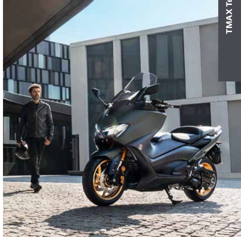
TMAX Tech MAX