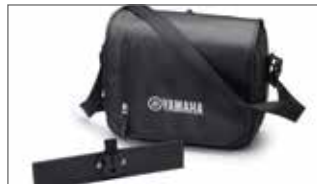
Underseat Compartment Divider with Bag B74-F85M0-00-00