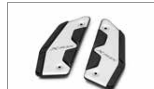
Foot Boards B74-F74M0-00-00