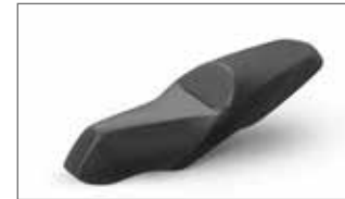
Low seat B74-F47C0-L0-00