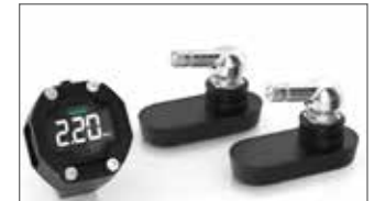
Tyre Pressure Monitoring System YME-HTPMS-00-00