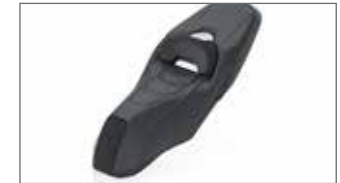
Comfort Seat B74-F4730-A2-00