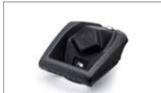
Universal stay B74-F81A0-10-00