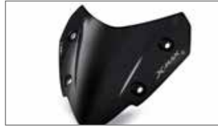
Sport Screen B74-F83J0-00-00