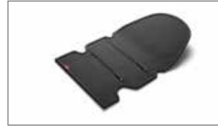
Trunk Organizer B9Y-FTR00-00-00