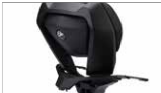
Passenger Backrest Stay B74-F84U0-00-00