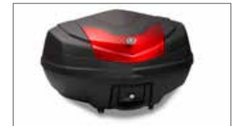
50L Top Case City 34B-F84A8-10-00