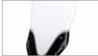
High Screen B74-F837J-01-00