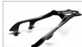
Rear Carrier B74-F48D0-00-00