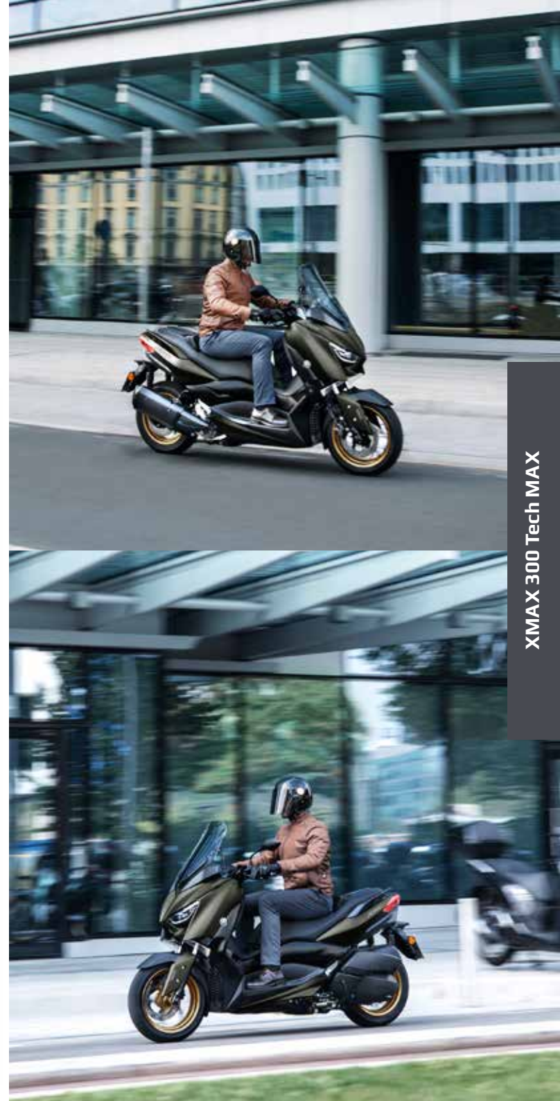
XMAX 300 Tech MAX