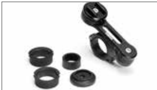
Bar Mount YME-FMKIT-00-00