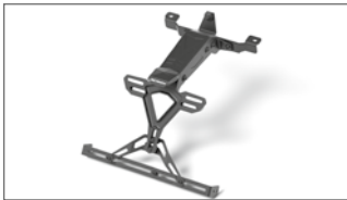
License Plate Holder XMAX B9Y-F16E0-00-00