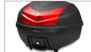
39L Top Case City 525-F84A8-00-00