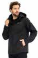
Urban sweater (Male) B21-UR106-B0-0L