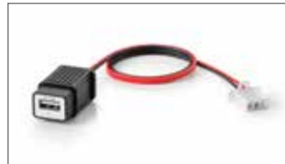
USB Device Charger 5V B4T-H6600-00-00