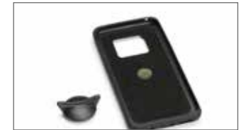
Yamaha Protection Case IPHONE YME-FCAS9-00-00