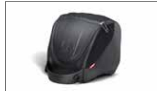
Console Bag B9Y-F0750-00-00