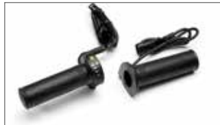
Grip Heater 120. YME-F2960-10-00