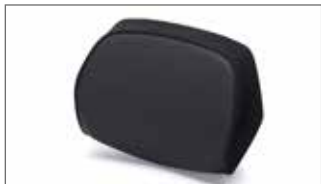
Passenger Backrest Cushion BV1-F843F-00-00