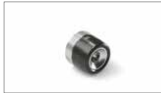
End Grip B9Y-F6246-U0-00