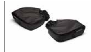
Hand Muffs B74-F85F0-00-00