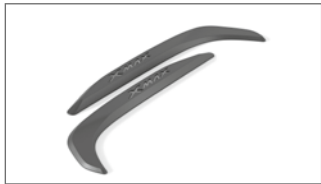
XMAX Scratch Protection B74-F1980-00-00