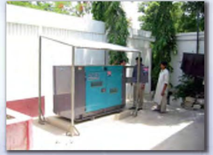
As the Emergency power source in the hospital.